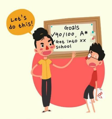
Set goals together

Encourage them to pursue their strengths, interests and try new things.